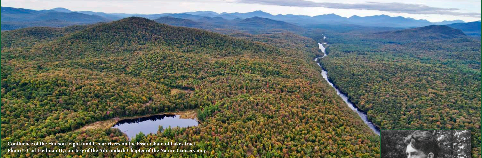
Confluence of the Hudson (right) and Cedar rivers on the Essex Chain of Lakes tract.