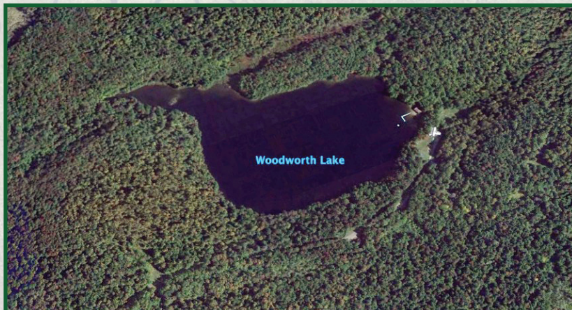
Woodworth Lake tract, formerly owned by the Boy Scouts, as it appears today