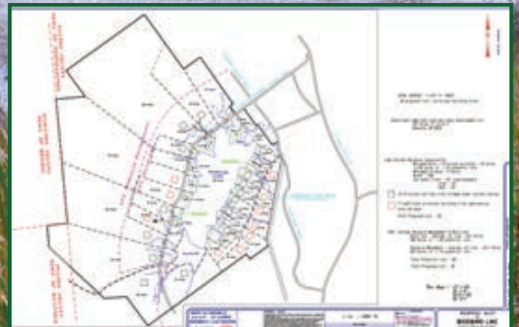
Woodward Lake near Northville.