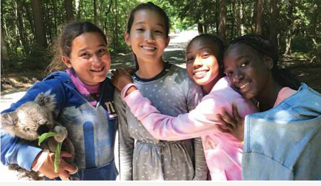
Campers, Camp Fowler in Speculator, 2018